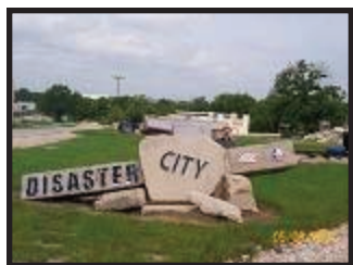
Staff site visit to "Disaster City" in Texas

The specific programs are worthy of individual updates, and I'd like to start off with Initiatives Program. The Initiatives Program at the H.E.L.P. Center has been extraordinarily busy over the past 90 days. We have received word from the Ohio Department of Health that budgets have been approved, allowing us to proceed forward with many of our projects. Additionally, the Initiatives Program has been busy submitting new grants, which are essential for continued funding of our programs. An additional responsibility of the Initiatives Program is to serve as ambassador to the H.E.L.P. Center. This has also been a very busy and time consuming process as our relationships continue to grow at an amazing pace with state agencies. Those agencies include the Ohio Department of Health, the Ohio Emergency Management Agency, the Ohio Department of Public Safety, and other state agencies. In the late